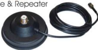
Mobile Radio Antennas