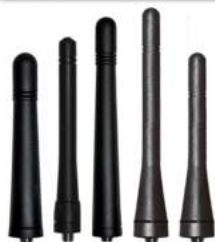
Portable Radio Replacement Antennas