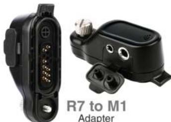
R7 to M1 Adapter